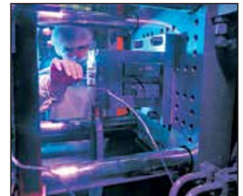
• Injection Molding Plants