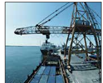
• Marine Industry