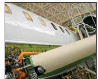
• Aerospace Industry