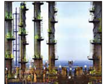
• Petrochemical Industry